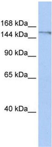
Image 2. Host: Rabbit Target Name: POLQ Sample Tissue: Human Thyroid Antibody Dilution: 1.0ug/ml