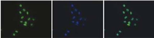
Image 2. Immunofluorescent staining of HeLa cell line with antibody followed by an anti-rabbit antibody conjugated to Alexa488 (left). The middle panel shows staining of the nuclei with DAPI. A merge of the two stainings (right).