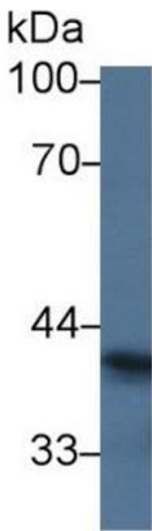
Image 2. Rabbit Capture antibody from the kit in WB with Positive Control: Sample Human A549 cell lysate.

Image 1. WB of Protein Standard: different control antibodies against Highly purified E. coli-expressed recombinant human SIGLEC7.