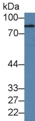
Image 1. Rabbit Capture antibody from the kit in WB with Positive Control: Bovine small intestine lysate.