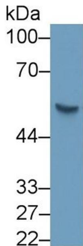
Image 1. SDS-PAGE of Protein Standard from the Kit (Highly purified E. coli-expressed recombinant human SHH).