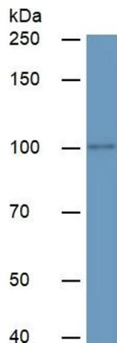
Image 3. Rabbit Detection antibody from the kit in WB with Positive Control: Sample Human serum.

Please check the product details page for more images. Overall 5 images are available for ABIN6730884.