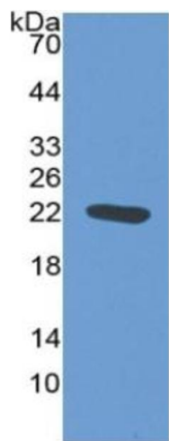
Image 3. WB of Protein Standard: different control antibodies against Highly purified E. coli-expressed recombinant human NOS2.

Please check the product details page for more images. Overall 4 images are available for ABIN6730909.