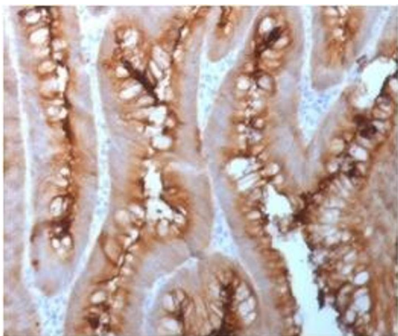
Image 2. Formalin-fixed, paraffin-embedded human Melanoma stained with CEA Rabbit Recombinant Monoclonal Antibody (C66/1983R).