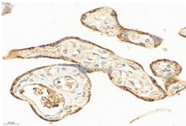
Image 2. Immunohistochemistry analysis of paraffin-embedded human tonsil using ME2 (ABIN7074757) at dilution of 1: 6000