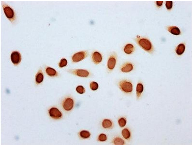
Image 1. Immunocytochemistry analysis of ABIN7139149 diluted at 1:20 and staining in HeLa cells (treated with 30mM sodium butyrate for 4h) performed on a Leica Bond TM system. The cells were fixed in 4% formaldehyde, permeabilized using 0.2% Triton X-100 and blocked with 10% normal goat serum 30min at RT. Then primary antibody (1% BSA) was incubated at 4°C overnight. The primary is detected by a biotinylated secondary antibody and visualized using an HRP conjugated SP system.