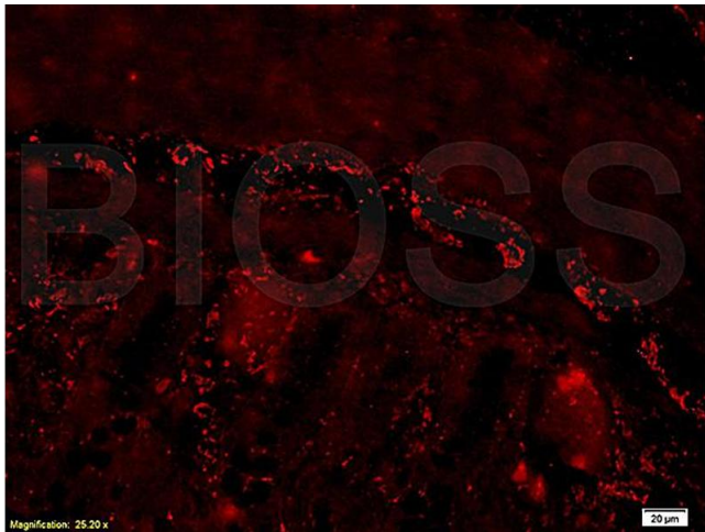
Image 1. Formalin-fixed and paraffin embedded rat brain tissue labeled with Rabbit Anti-PACAP-38 Polyclonal Antibody (ABIN726215), Unconjugated at 1:200 followed by conjugation to the secondary antibody and DAB staining.