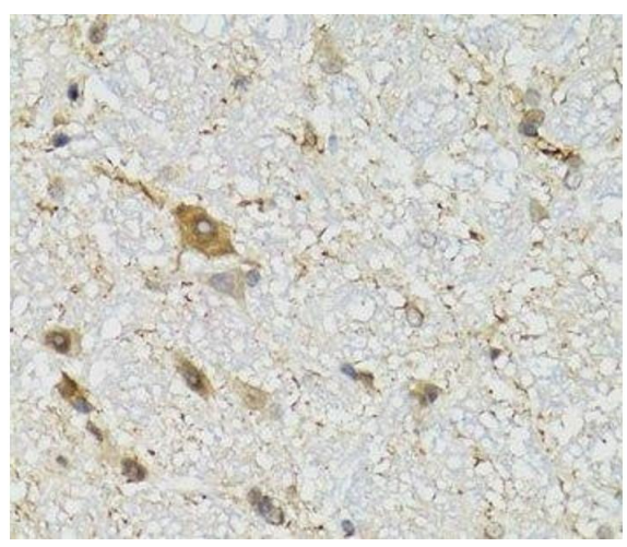
Image 1. Immunofluorescence analysis of A549 cells using COQ3 Polyclonal Antibody