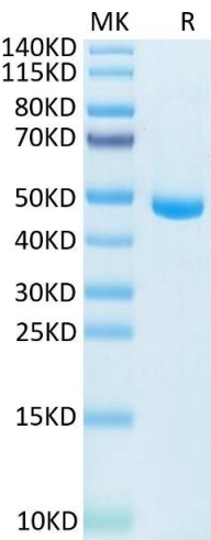
Image 2. Human IL-20 on Tris-Bis PAGE under reduced condition. The purity is greater than 95 % .