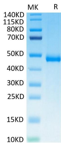
Image 3. Biotinylated Human KIR3DL3 on Tris-Bis PAGE under reduced condition. The purity is greater than 95 % .