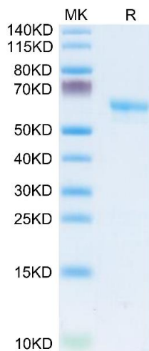
Image 1. Human LAMP5 on Tris-Bis PAGE under reduced condition. The purity is greater than 95 % .