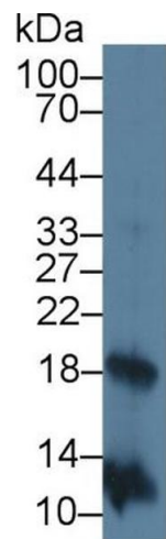
Image 1. Detection of IL2 in Rat Stomach lysate using Monoclonal Antibody to Interleukin 2 (IL2)