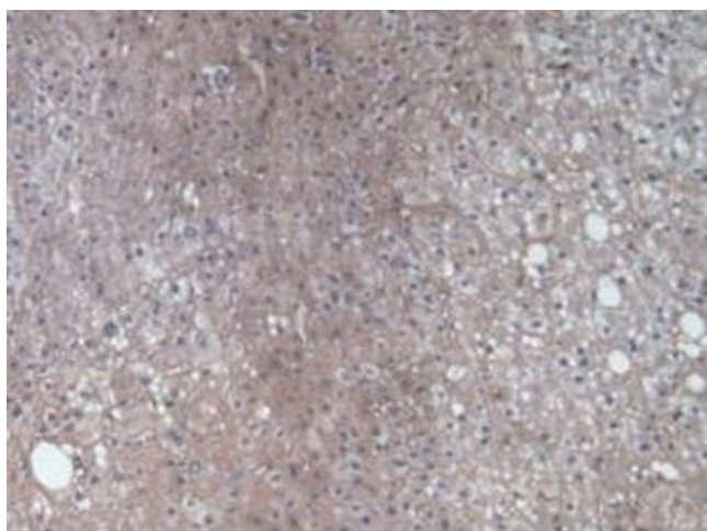
Image 1. Detection of Kim1 in Human Kidney Tissue using Monoclonal Antibody to Kidney Injury Molecule 1 (Kim1)