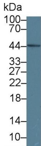
Image 1. Detection of a1AGP in Rat Testis lysate using Monoclonal Antibody to Alpha-1-Acid Glycoprotein (a1AGP)