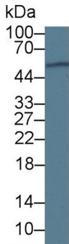
Image 1. Detection of a1AGP in Rat Pancreas lysate using Monoclonal Antibody to Alpha-1-Acid Glycoprotein (a1AGP)