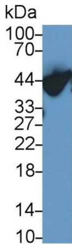
Image 1. Detection of a1AGP in Human Plasma using Polyclonal Antibody to Alpha-1-Acid Glycoprotein (a1AGP)