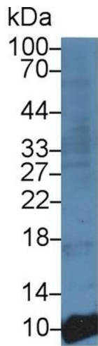
Image 1. Detection of GT in Porcine Stomach lysate using Polyclonal Antibody to Gastrin (GT)