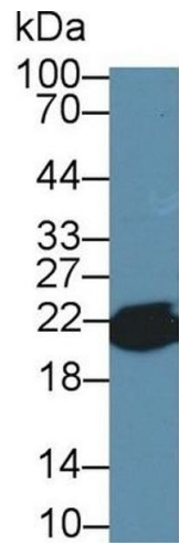
Image 1. Detection of CYPB in Mouse Liver lysate using Polyclonal Antibody to Cyclophilin B (CYPB)