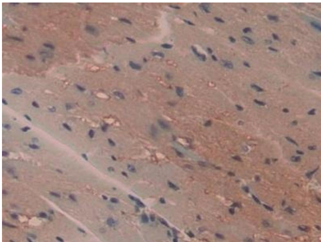
Image 3. Detection of CYPB in Mouse Heart Tissue using Polyclonal Antibody to Cyclophilin B (CYPB)

Image 2. Detection of Recombinant CYPB, Mouse using Polyclonal Antibody to Cyclophilin B (CYPB)