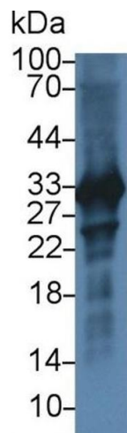
Image 1. Detection of cTnI in Rat Heart lysate using Polyclonal Antibody to Cardiac Troponin I (cTnI)