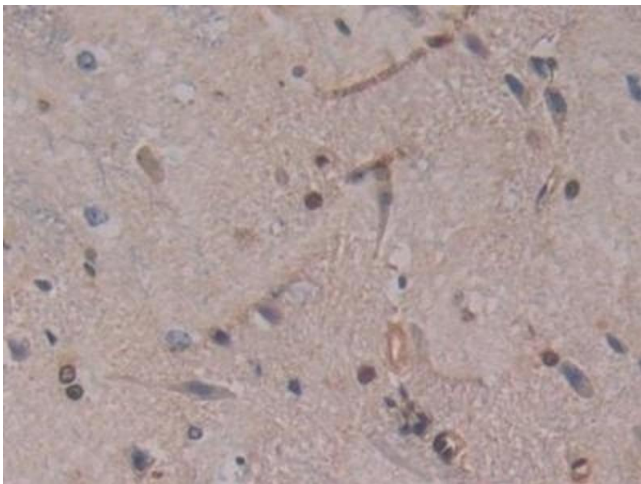
Image 2. Detection of Recombinant GSTt2, Rat using Polyclonal Antibody to Glutathione S Transferase Theta 2 (GSTt2)