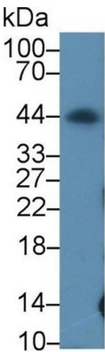
Image 1. Detection of PDL1 in Porcine Skeletal muscle lysate using Polyclonal Antibody to Programmed Cell Death Protein 1 Ligand 1 (PDL1)