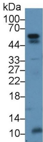
Image 1. Detection of ANGPTL2 in Mouse Stomach lysate using Polyclonal Antibody to Angiopoietin Like Protein 2 (ANGPTL2)