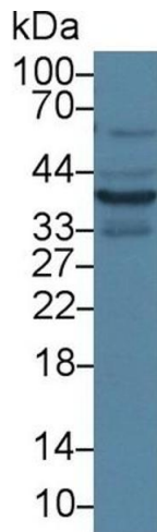
Image 1. Detection of ANXA1 in Human Hela cell lysate using Polyclonal Antibody to Annexin A1 (ANXA1)