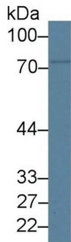
Image 1. Detection of SNX9 in Human 293T cell lysate using Polyclonal Antibody to Sorting Nexin 9 (SNX9)