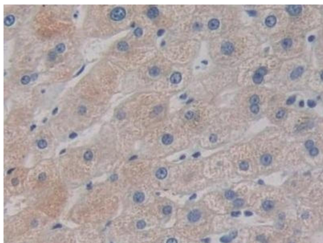
Image 2. Detection of Recombinant DCLK1, Human using Polyclonal Antibody to Doublecortin Like Kinase 1 (DCLK1)