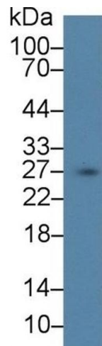
Image 1. Detection of SCGN in Porcine Stomach lysate using Polyclonal Antibody to Secretagogin (SCGN)