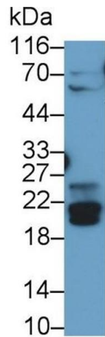
Image 1. Detection of BNIP3 in Rat Skeletal muscle lysate using Polyclonal Antibody to Bcl2/Adenovirus E1B 19 kDa Interacting Protein 3 (BNIP3)