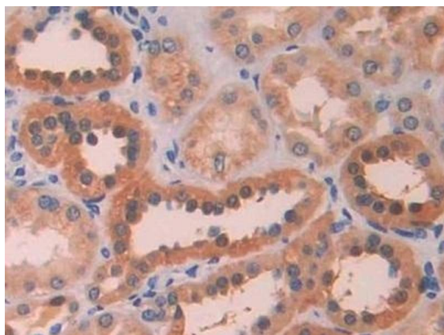
Image 2. Detection of Recombinant LOXL4, Human using Polyclonal Antibody to Lysyl Oxidase Like Protein 4 (LOXL4)