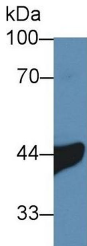
Image 2. Detection of IL3Ra in Human MCF7 cell lysate using Polyclonal Antibody to Interleukin 3 Receptor Alpha (IL3Ra)