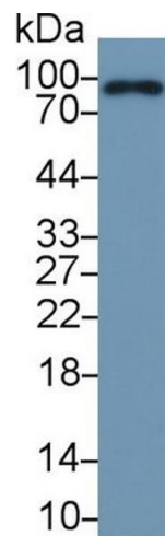
Image 1. Detection of CFB in Mouse Serum using Polyclonal Antibody to Complement Factor B (CFB)