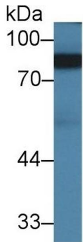
Image 1. Detection of ABP1 in Mouse Placenta lysate using Polyclonal Antibody to Amiloride Binding Protein 1 (ABP1)