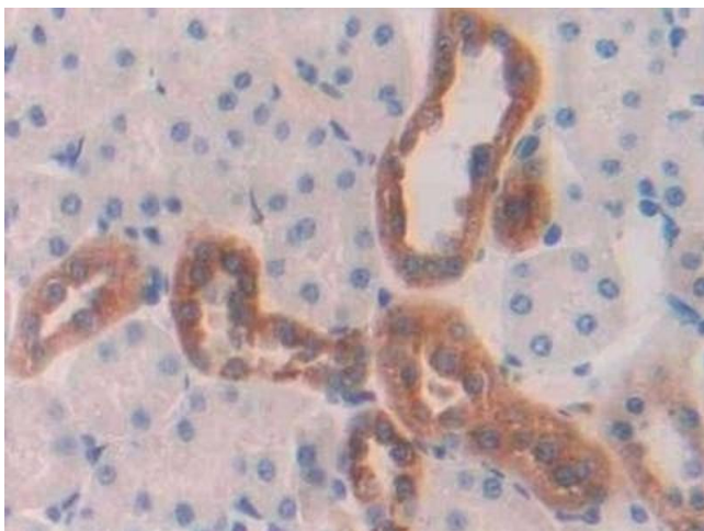
Image 2. Detection of Recombinant CTSD, Rat using Polyclonal Antibody to Cathepsin D (CTSD)