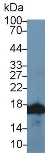
Image 1. Detection of HIST2H3A in Rat Heart lysate using Polyclonal Antibody to Histone Cluster 2, H3a (HIST2H3A)