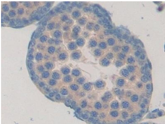
Image 2. Detection of Recombinant FBLN1, Rat using Polyclonal Antibody to Fibulin 1 (FBLN1)