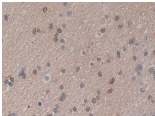
Image 2. Detection of Recombinant HSPA1A, Human using Polyclonal Antibody to Heat Shock 70 kDa Protein 1A (HSPA1A)