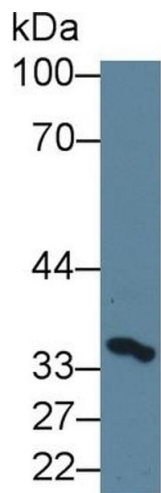
Image 1. Detection of SCCA1/SCCA2 in Porcine Cerebrum lysate using Polyclonal Antibody to Squamous Cell Carcinoma Antigen 1/2 (SCCA1/SCCA2)