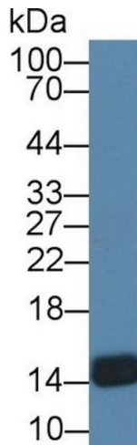
Image 3. Detection of FABP4 in Gallus Thymus lysate using Polyclonal Antibody to Fatty Acid Binding Protein 4 (FABP4)

Image 2. Detection of Recombinant FABP4, Chicken using Polyclonal Antibody to Fatty Acid Binding Protein 4 (FABP4)