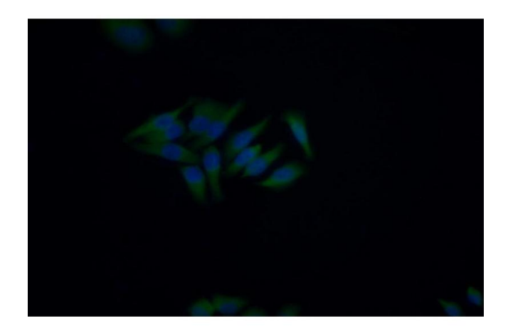
Image 2. Detection of Recombinant CD5, Human using Polyclonal Antibody to Cluster Of Differentiation 5 (CD5)