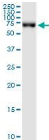
Image 2. DLAT MaxPab rabbit polyclonal antibody. Western Blot analysis of DLAT expression in human pancreas.