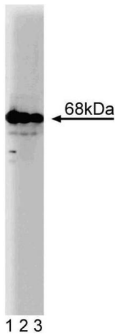
Western Blotting Image 1. Western blot analysis of G3BP on a SW-13 cell lysate (Human adrenal gland carcinoma, ATCC CCL-105) . Lane 1: 1:1000, lane 2: 1:2000, lane 3: 1:4000 dilution of the mouse anti-human G3BP antibody. G3BP may be observed migrating in a range of 55-70 kDa.