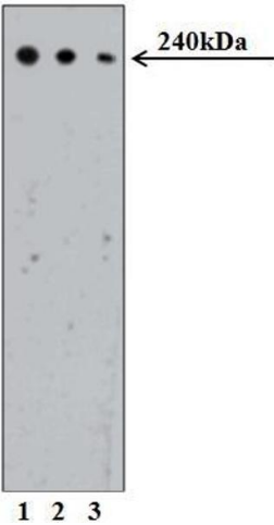
Image 2. Western blot analysis of CRIK on Human Jurkat cell lysate (ATCC TIB-152). Lane 1: 1:250, lane 2: 1:500, lane 3: 1:1000 dilution of anti-CRIK (5 min exposure).

Image 1. Western blot analysis of CRIK on Rat PC12 cell lysate (ATCC CRL-1721). Lane 1: 1:500, lane 2: 1:1000, lane 3: 1:2000 dilution of anti-CRIK.