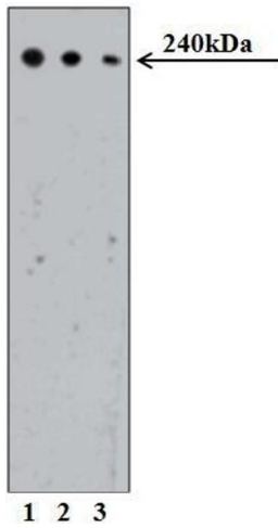
Image 1. Western blot analysis of CRIK on Rat PC12 cell lysate (ATCC CRL-1721). Lane 1: 1:500, lane 2: 1:1000, lane 3: 1:2000 dilution of anti-CRIK.